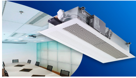
ACTIVAIR™ ACTIVE CHILLED BEAMS