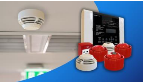
SMARTCELL™ WIRELESS FIRE DETECTION