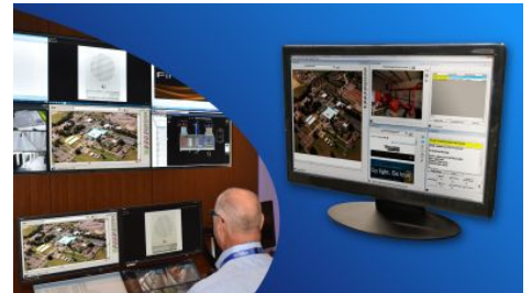
FIREWORKS® INCIDENT MANAGEMENT PLATFORM