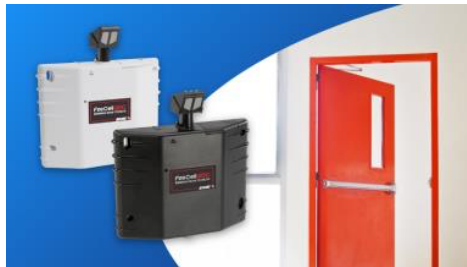
FIRECELL™ WIRELESS DOOR CONTROL