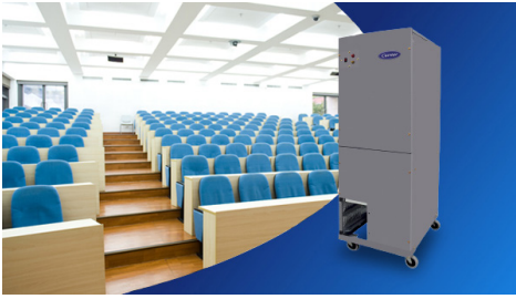
OPTICLEAN™ AIR SCRUBBER