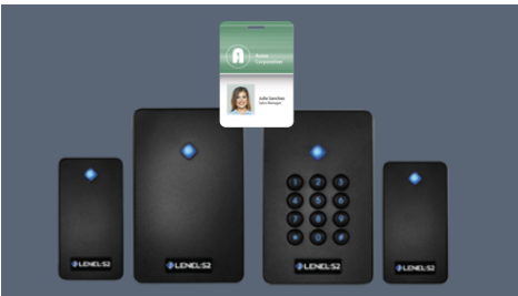
READERS AND PHYSICAL CREDENTIALS