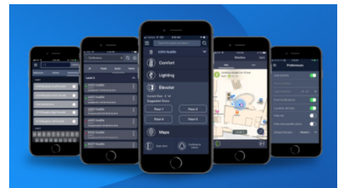
MYWAY™ BUILDING SERVICES MOBILE PLATFORM