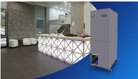
OPTICLEAN™ AIR SCRUBBER