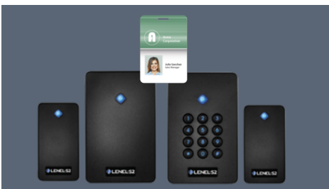
READERS AND PHYSICAL CREDENTIALS