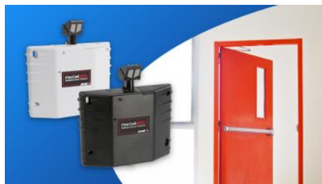
FIRECELL™ WIRELESS DOOR CONTROL