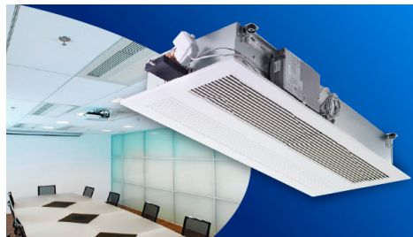
ACTIVE CHILLED BEAMS