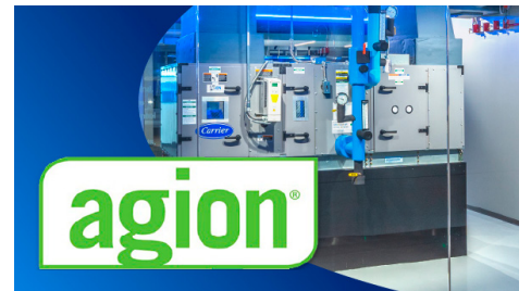
AGION®-COATED AIR-HANDLING UNIT